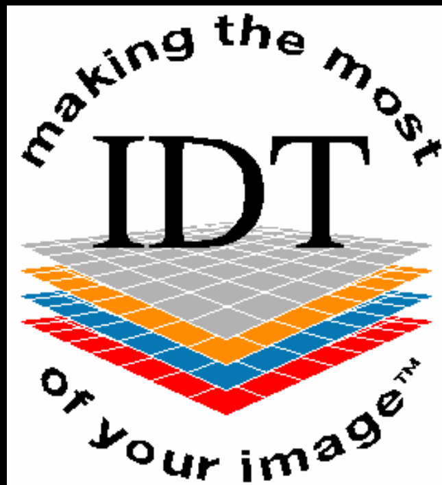
Image Diagnostic Technology Ltd

Unit GC, Westpoint, 36 Warple Way, London W3 0RG